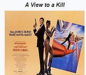
Theatrical release poster by Dan Gouzee